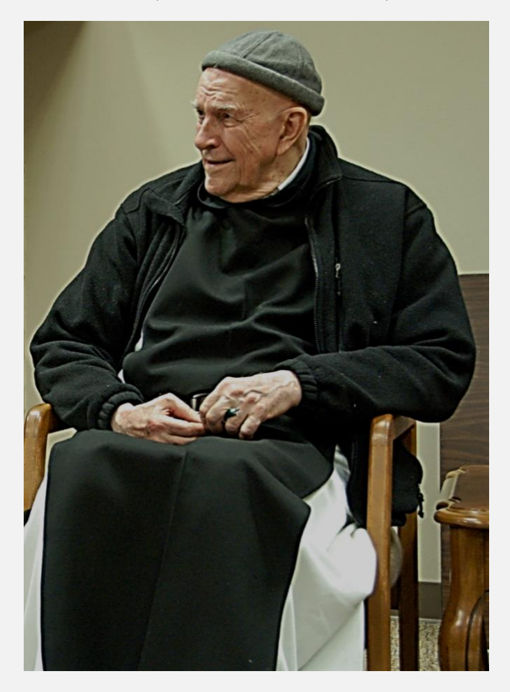
A Memorial Tribute Contemplative Outreach Northwest Saturday, January 5, 2019 Gathering 9:30am ~ Liturgy 10:00am

St. Andrew's Episcopal Church, 111 NE 80th Street, Seattle WA